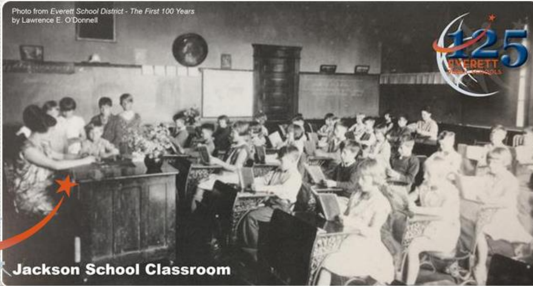
Jackson School Classroom